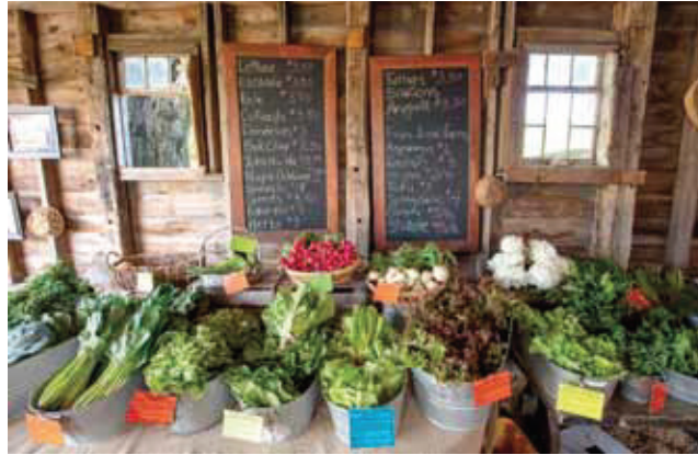
Ethos Farm utilizes certified organic farming methods and hopes to be "certified regenerative" soon.

I did go to medical school and became a doctor, but in the back of my mind, I never relinquished the desire to farm. And then, when I reached midlife, I started to think about it again. And being an environmentalist and a naturalist, I started responding to the drumbeat of environmental decline, and it started to become overwhelming. When