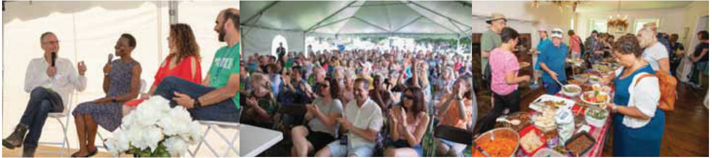
Ethos Farm Day includes speakers, free lectures, and delicious plant-based potluck lunches.

The average age is now about 60, and there are very few young farmers coming up who know how to grow healthy food. You have to remember that a lot of the knowledge that was within the farming community has been lost in the last hundred years with the adoption of chemical-based agriculture.