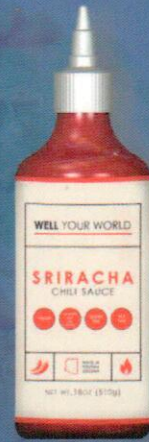
SRIRACHA CHILI SAUCE