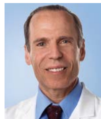
JOEL FUHRMAN, MD

President and Co-founder of Farm Sanctuary